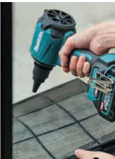
Nozzle 7 set Part No. 191X13-7 For filter cleaning