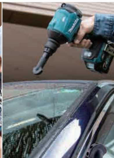
Wide range nozzle set Part No. 191X19-5 For wide range blow-off