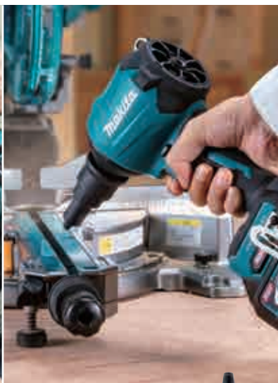
Nozzle 3 set Part No. 191X11-1 For cleaning narrow spaces (can be used like an air spray can)