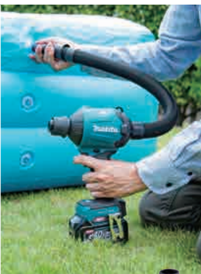
Rubber attachment 20-30 set Part No. 191X25-0 For deflation large play pools and inflatable beds etc.*1