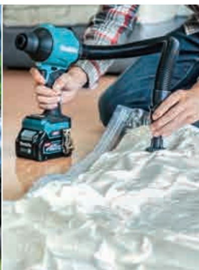
Rubber attachment 65 set Part No. 191X27-6 For deflating futon (bedding) compression bag*1