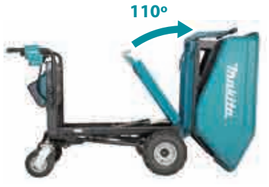
[Can be manually tilted for more than 75°]