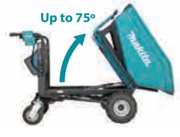
[Tilts electrically up to 75°] (Tilts to 75° in approx. 30 seconds.)