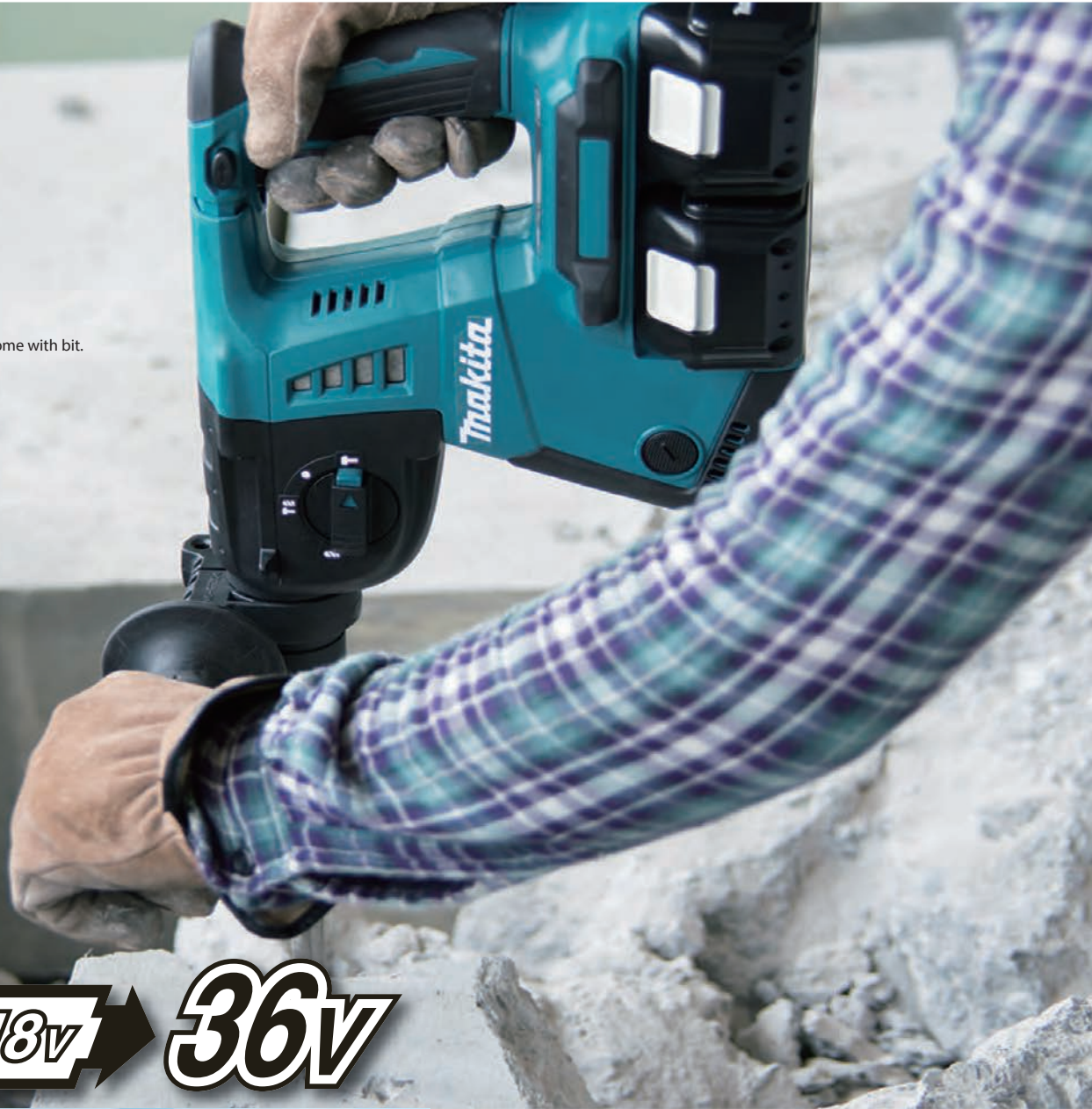
Photo : DHR264 Tool does not come with bit.