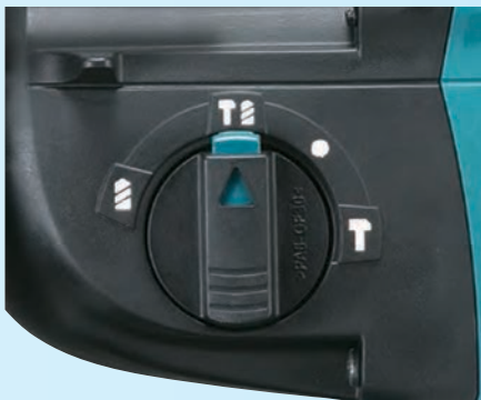
Photo : DHR264 Tool does not come with bit.