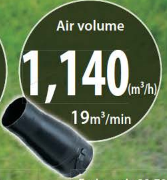
End nozzle 90-70 Blowing volume-oriented