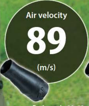
End nozzle 90-60 Blowing velocity-oriented