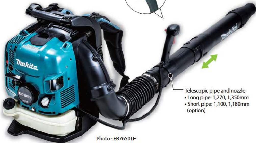
Photo : EB7650TH

redesigned to provide a comfortable grip to user's hand and an optimal center of gravity to the machine during transport