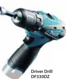
Driver Drill DF330DZ Tool does not come with bit.