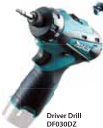
Driver Drill DF030DZ