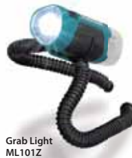
Grab Light ML101Z