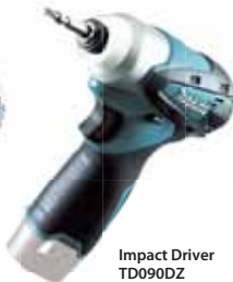
Impact Driver TD090DZ