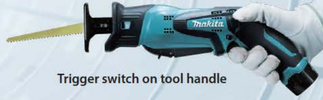
Trigger switch on tool handle