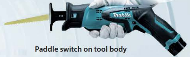
Paddle switch on tool body