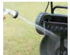
The inside of cutting deck can be washed.

(Self-propelled section must not get wet with water.)