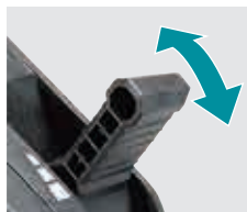
Variable speed control lever