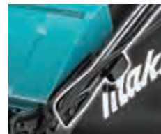
Rigid foldable handle