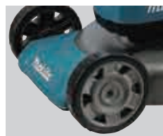
Large wheel front/rear ø230mm

(Self-propelled section must not get wet with water.)