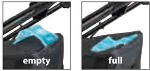
Grass box with indicator