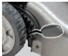
One hand cutting height adjustment