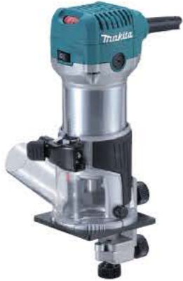
Trimmer base assembly with Square base plate

Convenient for cutting workpiece using guide rule, auxiliary wood fence