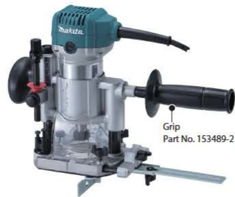
Plunge base assembly with Side grip

Convenient for cutting while applying weight on one of the two handles of the base