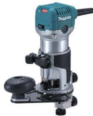
Offset base plate with Grip of Plunge base assembly

Convenient for cutting workpiece using guide rule, auxiliary wood fence