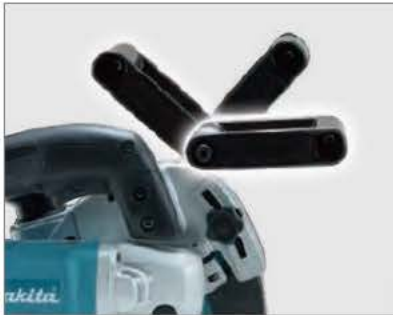
Ergonomically designed front handle