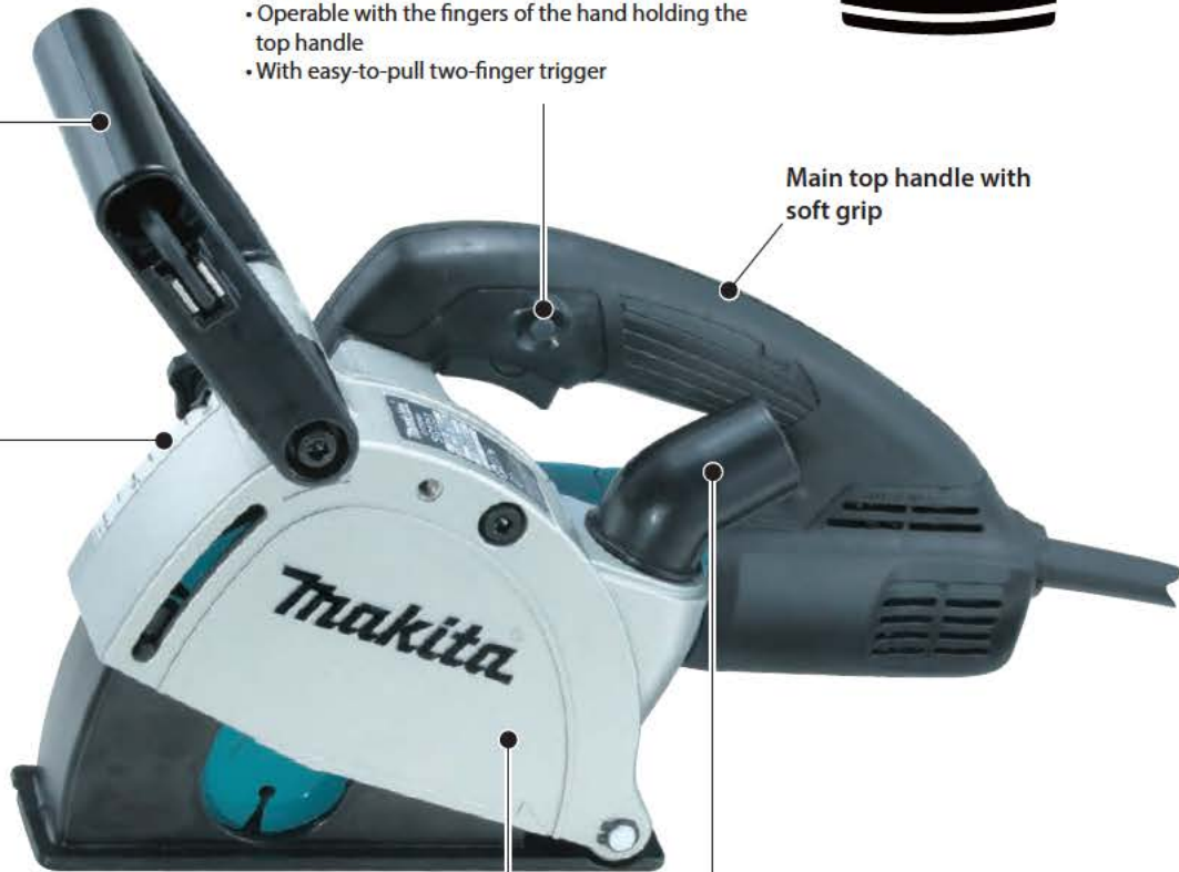
Main top handle with soft grip