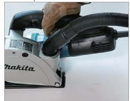
Connectable to vacuum cleaners for clean work environment