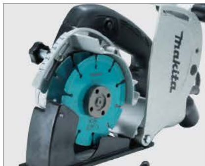
Aluminum blade case designed to allow for easy blade replacement