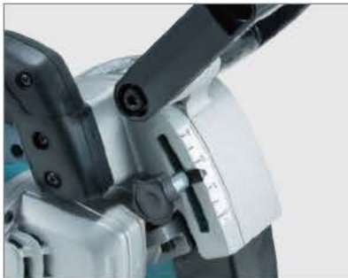
Adjustable cutting depth