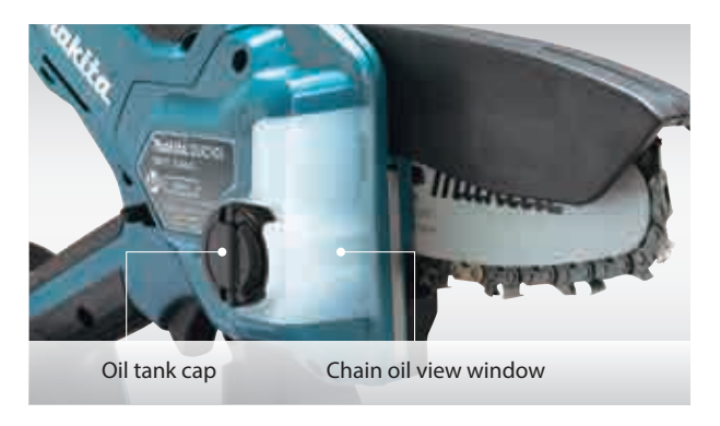
minimizes the chance that saw chain will stall due to forgetting to supply chain oil.